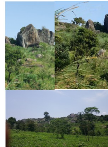
Visiting Nature in the Community