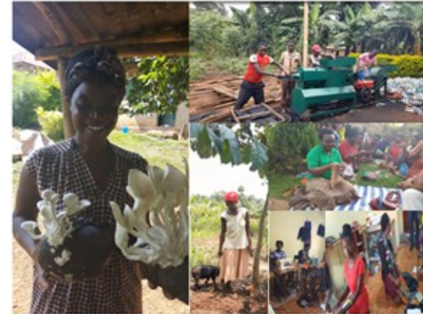
Funds from the demonstration site and the cottages have helped Train women start mushroom growing, piggy, start a vocational Training center and set up briquettes making from crop wastes