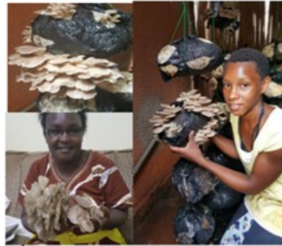
Mushroom Growing From Locally Available Cheap Materials