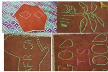
Some of the hand craft items made by local women