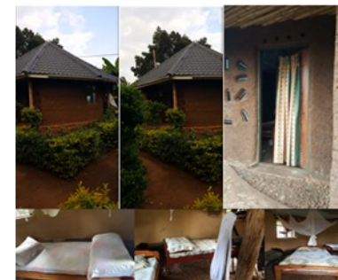
Wamu Cottages on Eco-Agric Uganda Demonstration site