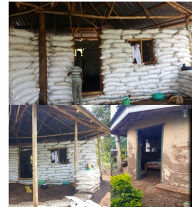
Sustainable Eco-Friendly/Earth Building